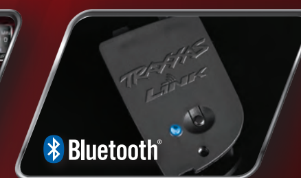
Traxxas Link™ Wireless Module connects with your iPhone, iPad, or iPod touch*