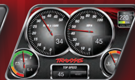
Telemetry Sensors Installed View speed, RPM, temperature, and voltage data on the Traxxas Link dashboard