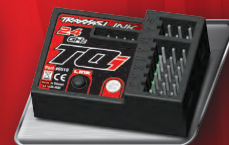
5-Channel Receiver With 3 Telemetry Ports